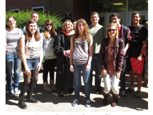
Honors First Year Seminar Class gathering before Convocation