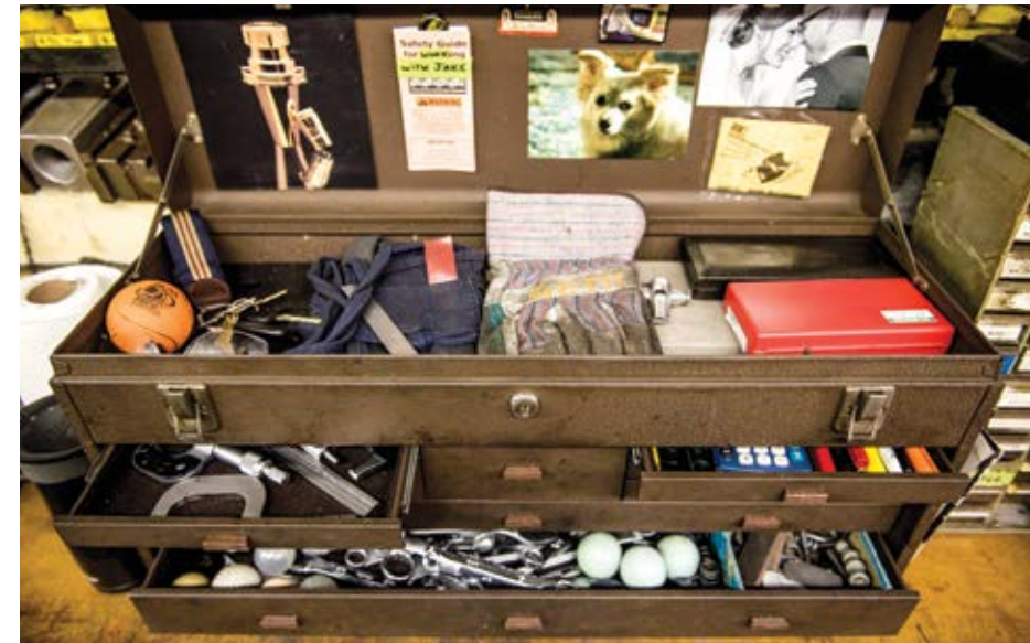
Mine 44"x 60" Digital Print 2014