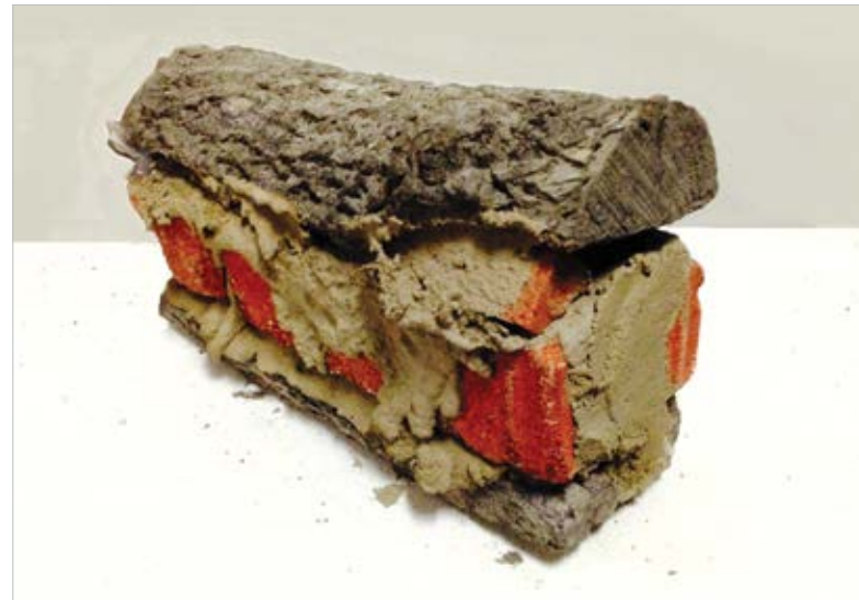
Sandwich 12"x 5"x 8" Mixed Media 2015