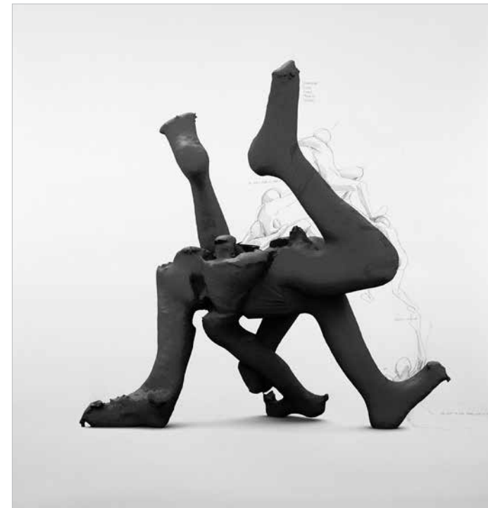
42 x 42 #3 42"x 42" Inkjet print and Graphite 2015