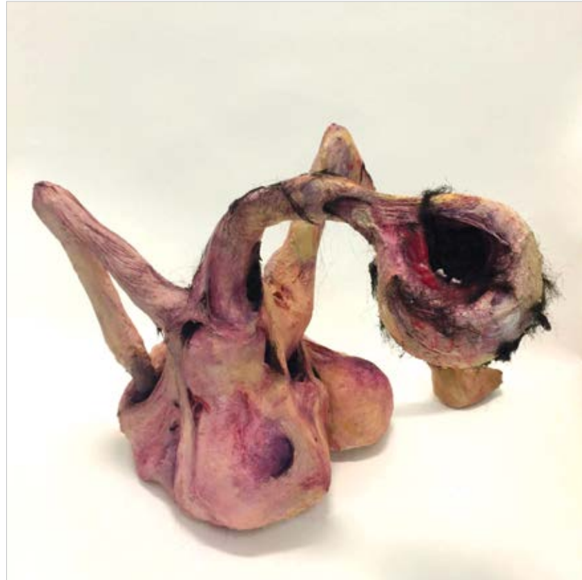
Figure Study with Bile 33"19"x22" Styrofoam, paper mache, latex, acrylic 2015